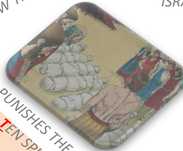
GOD PUNISHES THE OTHER T EN SPIES