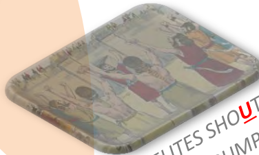
ISRAELITES SHOU T AND BLOW TRUMPETS