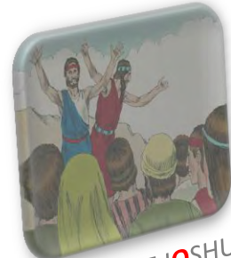
PEOPLE REJECT J O SHUA AND CALEB'S REPORT