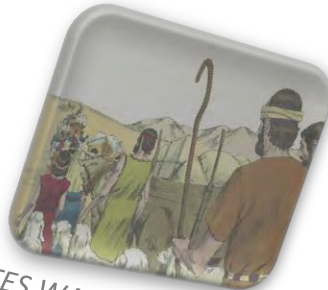
ISRAE L ITES WANDER THE DESERT FOR FORTY YEARS