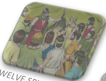
TWELVE SPIES CHOSEN TO EXPL P LORE LAND