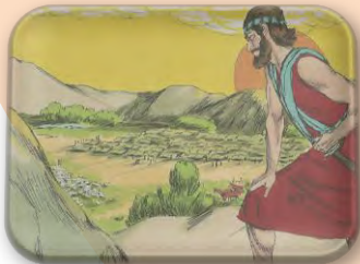
SPIES ENTER JERICH O

Place the pictures from the story of the Promised Land in order by entering the red letter from each picture in the correct sequence blocks below.