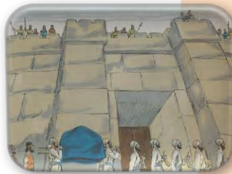
ISRAELITES MARCH AROUND JERICH O FOR S IX DAYS