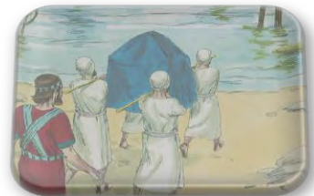
ISRAE L ITES CROSS THE JORDAN