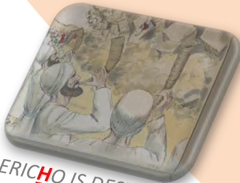
JERICH H O IS DESTROYED